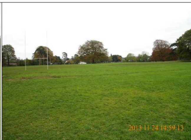
View above facing East at 15.00 pm on Sunday 24.11.13