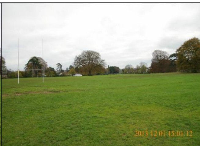
View above is facing East at 3.00 pm on Sunday 01.12.13