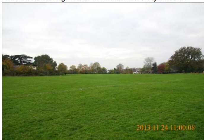
View above facing South West at 11.00 am on Sunday 24.11.13