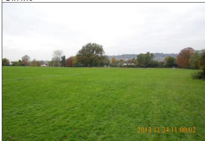
View above facing West at 11.00 am on Sunday 24.11.13