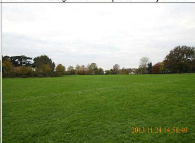
View above facing South West at 14.58 pm on Sunday 24.11.13