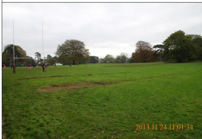
View above facing East at 11.01 am on Sunday 24.11.13