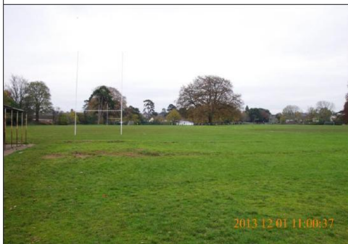
View above is facing East at 11.00 am on Sunday 01.12.13