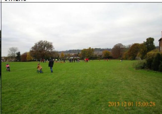
View above is facing West at 3.00 pm on Sunday 01.12.13

In addition to these photographs and for a complete register of weekend pitch use from 10-Nov-13 to 01-Dec-13 please see page 10 of this response. This register confirms that usage during this period did not exceed the use set out in the schedule of use in paragraph 14 of the Inspector's Report dated 22 nd May 2013 i.e. providing further evidence that paragraph 14 in the Inspector's Report was neither "wrong nor inadequate".