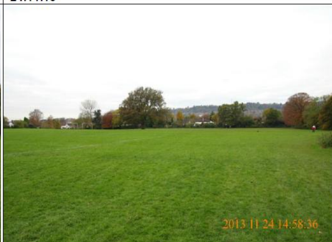
View above facing West at 14.58 pm on Sunday 24.11.13

In addition to these photographs and for a complete register of weekend pitch use from 10-Nov-13 to 01-Dec-13 please see page 10 of this response. This register confirms that usage during this period did not exceed the use set out in the schedule of use in paragraph 14 of the Inspector's Report dated 22 nd May 2013 i.e. providing further evidence that paragraph 14 in the Inspector's Report was neither "wrong nor inadequate".