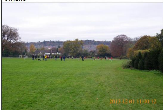
View above is facing West at 11.00am on Sunday 01.12.13