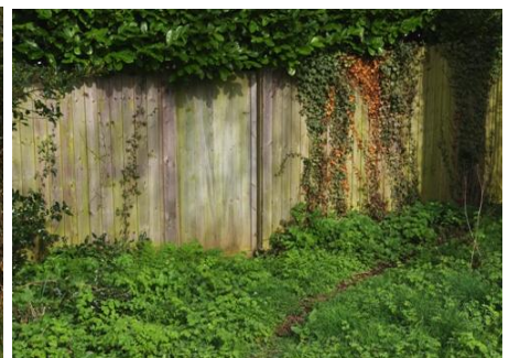
Ref 13 f