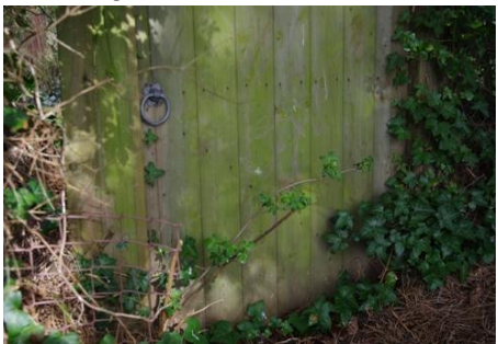
Ref 13 g