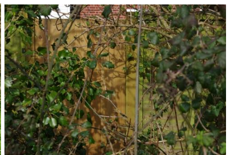
Ref 13 i