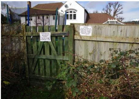
Ref 13 d