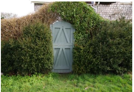
Ref 13 j