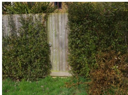
Ref 13 e