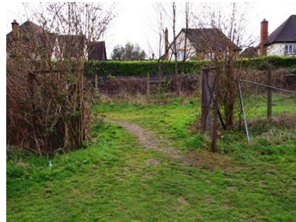
South East corner of the site at the junction of Parry's Lane and Shirehampton Road