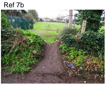
South East Boundary of site adjacent to Parry's Lane