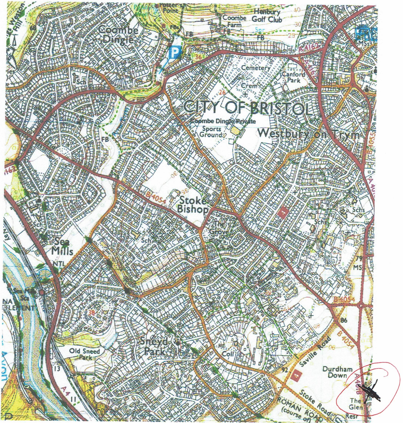
Map "B" of locality surrounding Stoke Lodge Parkland